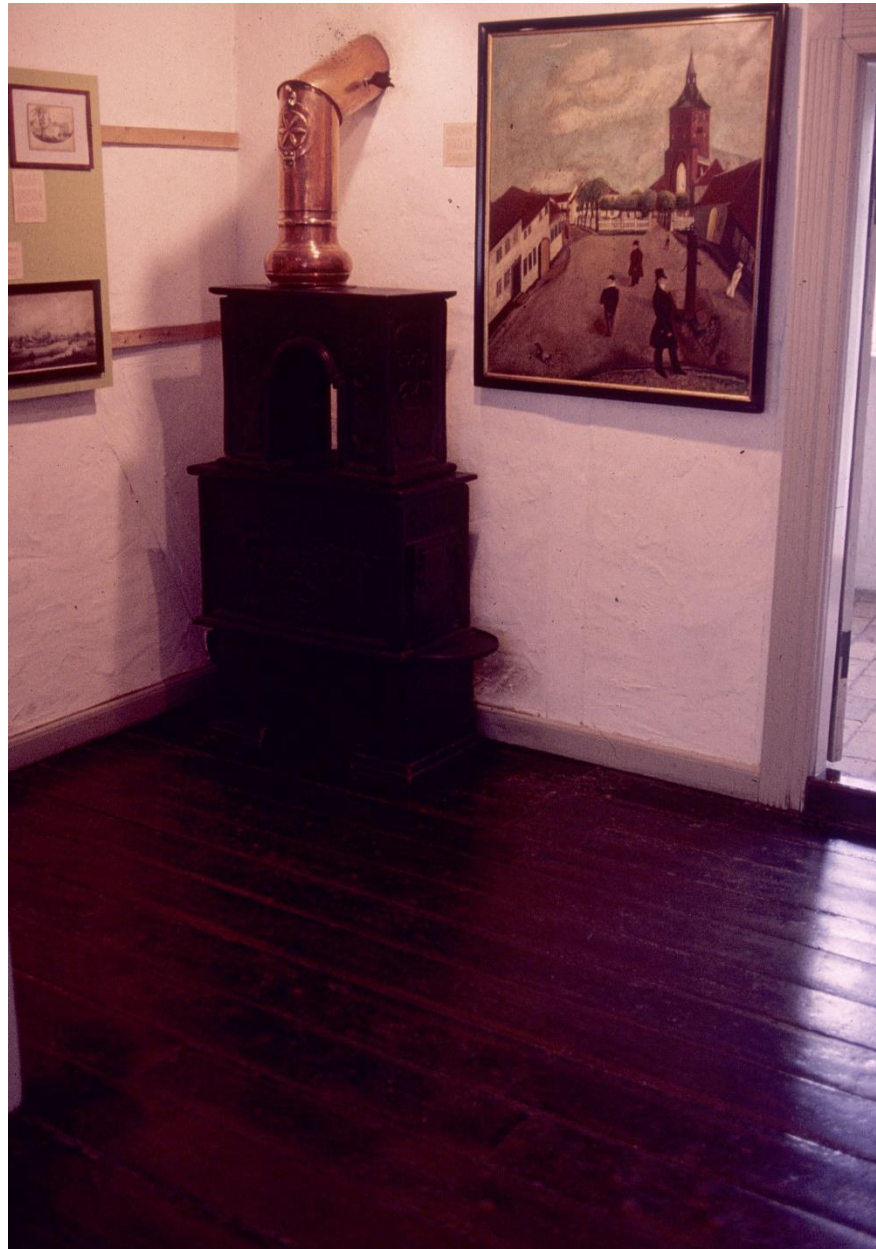
Hans Christian Andersen's (1805-1875) born house