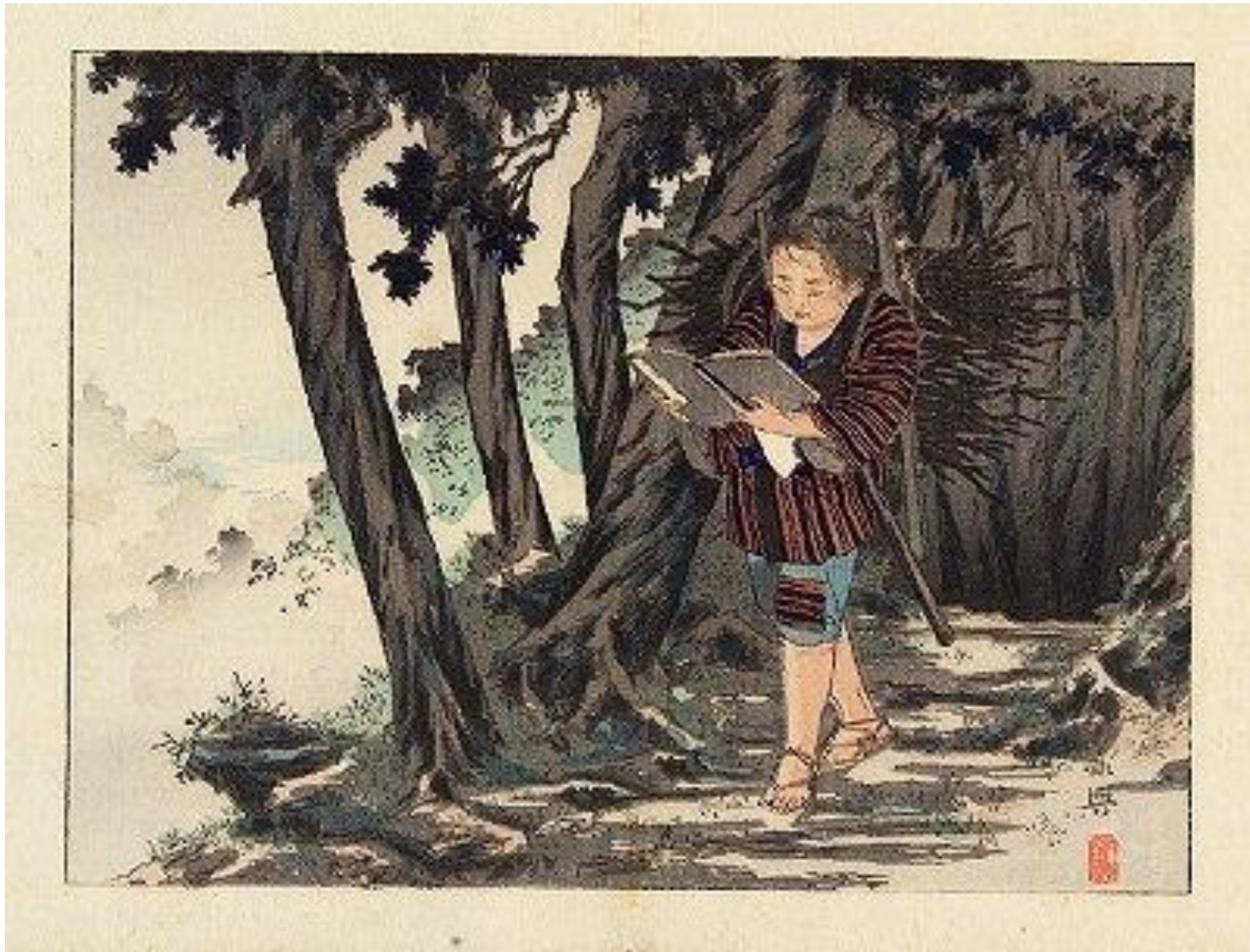
Kinjirou Ninomiya (1787-1856)