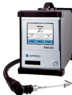
Portable PM emission measurement: Afriso STM 225, Wöhler SM 500, Testo 380; MRU FSM 3